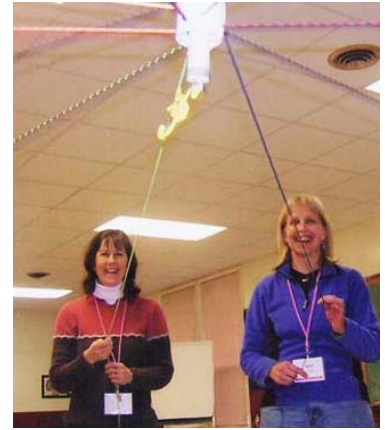
New activities & old friends!

We hope you are able to attend the All Camp Staff Retreat on January 17-18, 2009 at the Cispus Learning Center. We are expecting 50-75 people for this event that started in 2006 as a part of our 50-year anniversary celebration. Our goal is to have representation from each of the seven high school camps, four middle level camps and three cheerleadership sessions. Last summer our combined efforts served 3,460 student leaders and advisers!