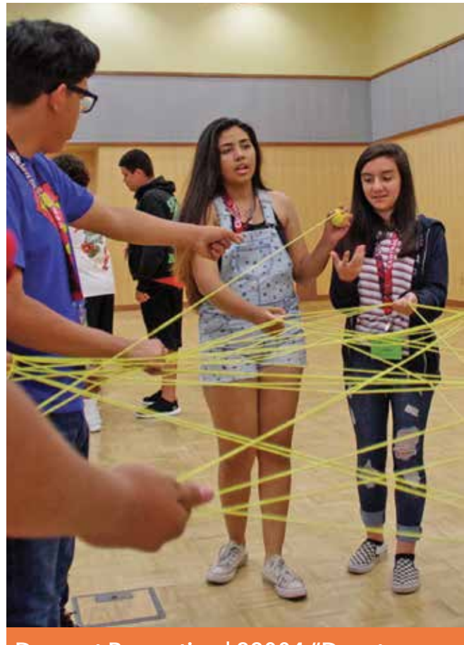
Dropout Prevention | 22004 "Dare to Dream: Exploring Your Future"

Thanks to the vision and support of principals across the state of Washington, this initiative has far reaching benefits for students, administrators, and families. Our future is bright as we plan to add more classes and offerings to our course list.