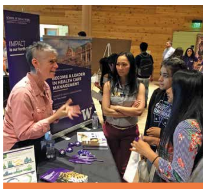
Health Science | 14251

College Mathematics Preparations courses solidify quantitative literacy through the use and extension of algebraic, geometric, and statistical concepts. Course content typically includes algebraic operations, solutions of equations and inequalities, number sets, coordinate geometry, functions and graphs, probability and statistics, and data representation.