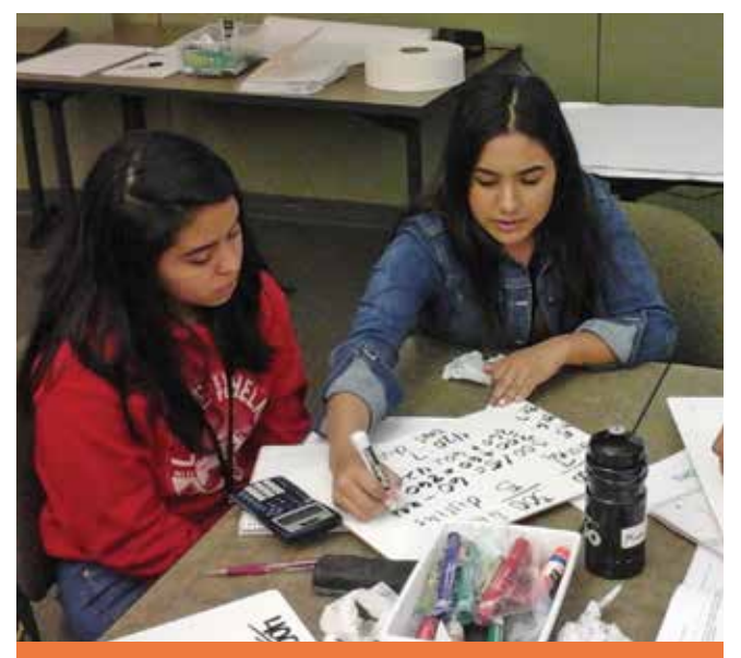
College Mathematics Preparation | 02138

Unified Science courses combine more than one branch of science into a cohesive study or may integrate science with another discipline. General scientific concepts are explored, as are the principles underlying the scientific method and experimentation techniques.