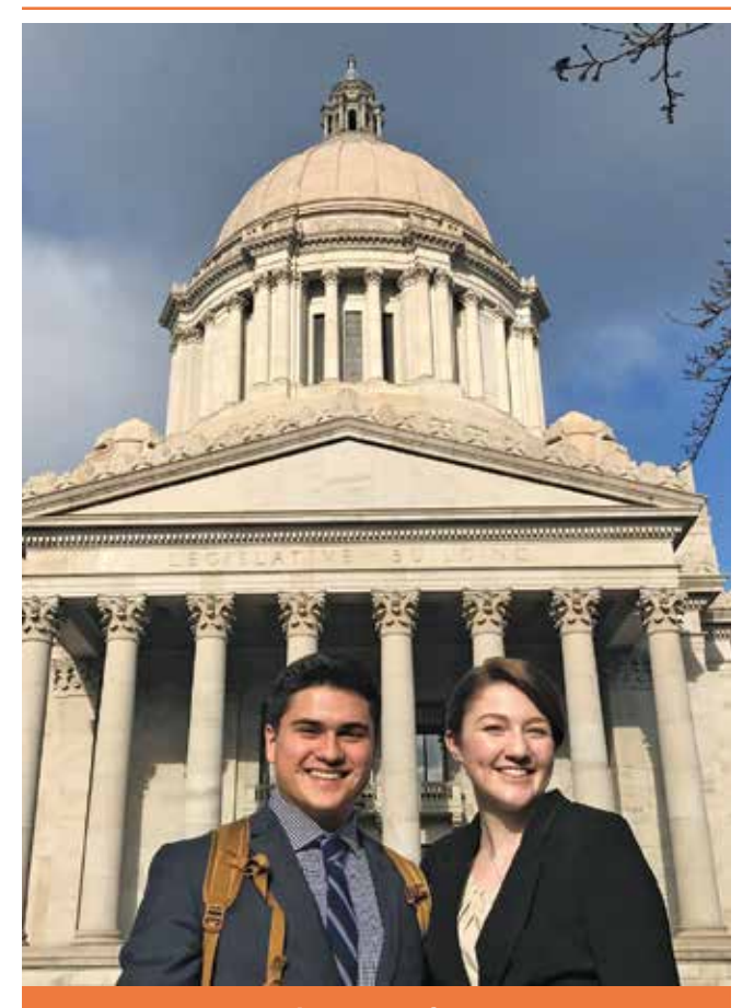
Government, Politics and Law – Independent Study | 04197 (in cooperation with the State Board of Education Student representatives)

This course enables students to explore topics of interest within one of the fields of Government, Politics, and Law. These courses may provide students with an opportunity to expand their expertise in a particular specialization, to explore a topic of special interest, or to develop more advanced skills.