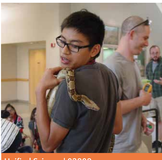
Unified Science | 03202

Informal Mathematics courses emphasize the teaching of mathematics as problem solving, communication, and reasoning, and highlight the connections among mathematical topics and between mathematics and other disciplines.