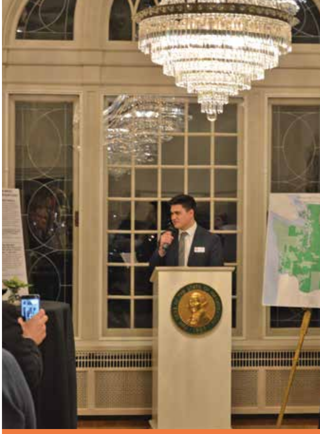
Public Policy | 15203 (in cooperation with the State Board of Education Student representatives)

This course enables students to explore topics of interest within one of the fields of Government, Politics, and Law. These courses may provide students with an opportunity to expand their expertise in a particular specialization, to explore a topic of special interest, or to develop more advanced skills.